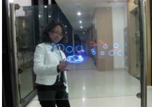
Sample image projected on film with dual color projector. Images move and flip, so messaging looks like a hologram and can be read on both sides of the window.