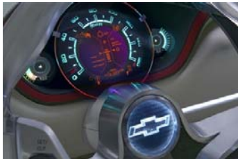
GM's Chevy Volt Concept Car with SuperImaging HUD