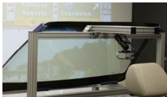
GM R&D Setup using SuperImaging HUD

SuperImaging's HUD projector uses dual laser diodes to make blue and red animations appear on clear glass. Using a special wide angle lens, the HUD projector can make graphics appear anywhere on the windshield.