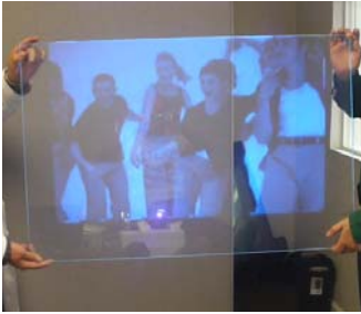
Sample video projected on glass.

MediaGlass can also be used in temporary installations for retail promotions and events, by having the film on a screen that unrolls wherever the display is needed, without requiring a glass surface.