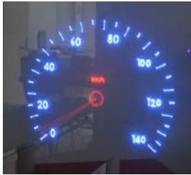
HUD Speedometer on tinted windshield