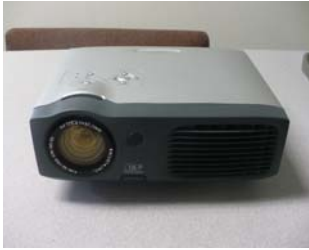
DLP video projector

The MediaGlass video projector displays video and any other graphics ala a normal DLP projector, but on clear glass. The projector is a modified DLP projector which outputs blu-ray and UV light, which glows once it strikes the MediaGlass film.