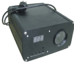
2 nd Generation Projector Industrial Design