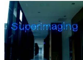
Image projected onto film

Graphics printing expenses. Promo material shipping costs. Logistics lead time and coordination. Time and money spent changing the store displays. LCD/plasma display impact on electrical expenses. What if you could make all these costs disappear? MediaGlass can be your tool to achieve operational savings. All these operational costs vanish, since to change out advertising, the store just changes the graphics file on the USB drive. No materials, no cost, just a quick USB drive file update.