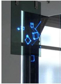
Saint Gobain's Paris Glass House Demo with monochrome MediaGlass projector