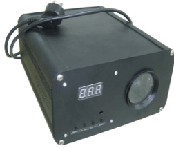
2 nd Generation Projector Industrial Design

MediaGlass displays text, logos, and animated graphics on clear glass. The principal application is store window messaging for customer engagement, branding, and increasing sales.